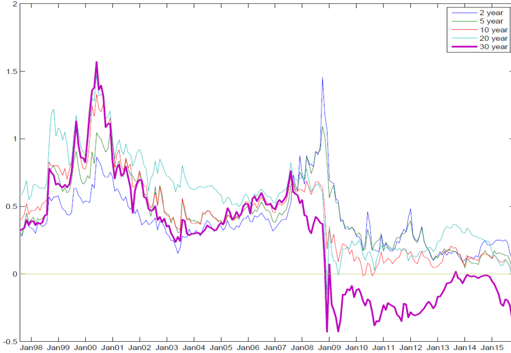
Figure 1: Swap Spreads. Difference between fixed swap rate and treasury yield of same maturity. Units are in percent.

Negative swap spreads are challenging for typical asset pricing models as they seem to imply a risk-free arbitrage opportunity. By investing in a treasury bond and paying the lower fixed swap rate, an investor can generate a positive cash flow. With typical repo financing for the bond, the investor would also receive a positive cash flow from the difference between LIBOR and the repo rate. If the position is held to maturity, this represents a risk-free arbitrage. In reality, a shorter horizon exposes the investor to the risk of an even more negative swap spread. Capital requirements and funding liquidity also make such an investment risky. While there seem to be good reasons for why arbitrage would be limited in this case, there are no equilibrium asset pricing models consistent with negative swap spreads.